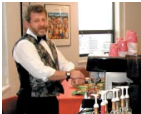
The Cappuccino Connection

December exams could not properly start without a lift from the Alumni Association. On the first exam day, the Center for Student Development was turned into a “Coffee House” with specialty coffees, teas, and cookies provided and served by “The Cappuccino Connection.” Also, renewing a new tradition, all students were given a holiday gift of JCHP notepads, with the heading, “2002 Things To Do,” to start off the New Year. Three lucky students guessed the “number of candy canes in the jar,” and won Jefferson bookstore gift certificates.