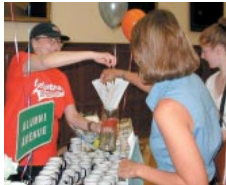
New students pick up coffee mugs.

The Alumni Association's special welcome, " The Tradition Starts Here, " was well received by new students at the College's August 2001 registration. Each year, the Alumni Association distributes coffee mugs to all new students. This year, newly designed mugs were distributed along with a chance to win Jefferson sports towels.