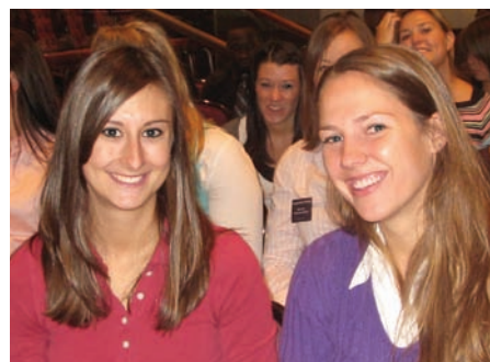
Occupational Therapy students wait for a 2009 AOTA Hill Day presentation to start.

OT alumnus Sinko agreed. “The Hill Day experience empowered me,” she said. “By being politically active, we empower our patients. Healthcare practitioners can be leaders outside of formal positions by advocating for their patients.” ★