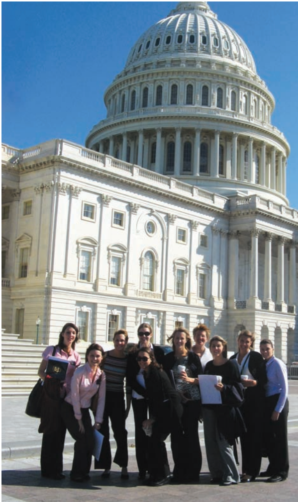
Occupational Therapy students participate in Capitol Hill Day each year.