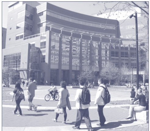
Another sunny day on the Lubert Plaza.