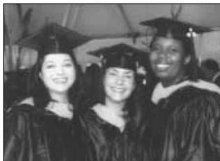
Commencement, Page 5