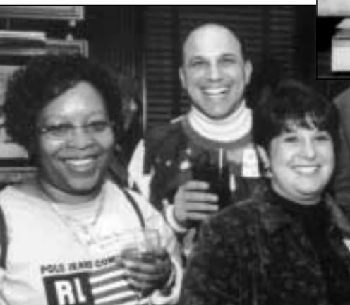
Alumni Relations, Page 4