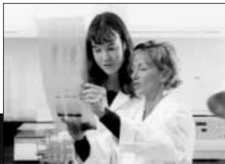
Laboratory Sciences, Page 2