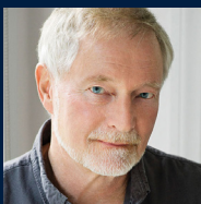
ERIK LARSON Award-Winning Author