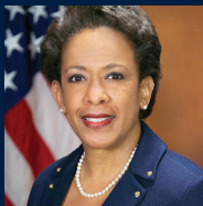
LORETTA LYNCH Former United States Attorney General