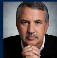
TOM FRIEDMAN New York Times Columnist