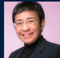
MARIA RESSA 2021 Nobel Peace Prize Winner