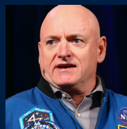
SCOTT KELLY NASA Astronaut